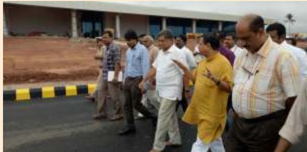
Inspecting Hubli Airport Works