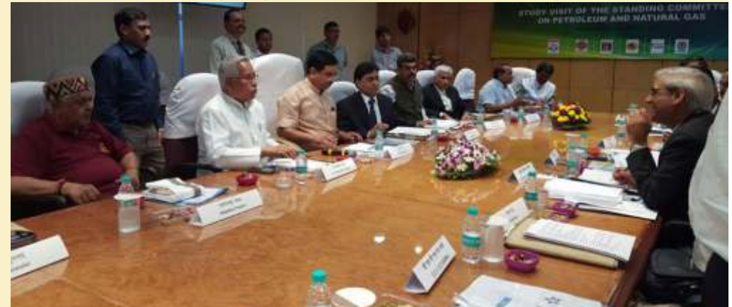
in the meeting of the standing committee on petroleum seen also with a senior officers of the department and the other members of the committee

This committee has submitted several reports to the Parliament on production and distribution of petroleum and natural gas industry, from time to time.