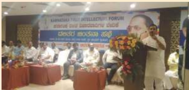
In a pro dalit symposium