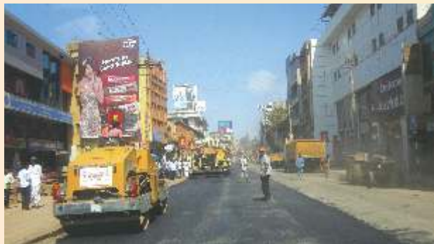
Hubli station road improved under CRF