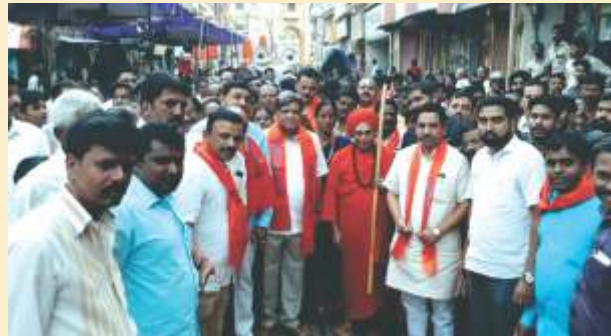
In the company of religious gifts of the constituency