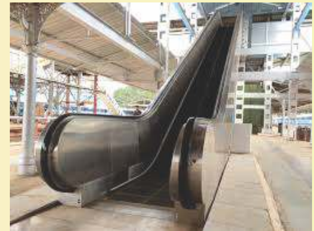
Hubli Railway Station is added with New facility of Escalators