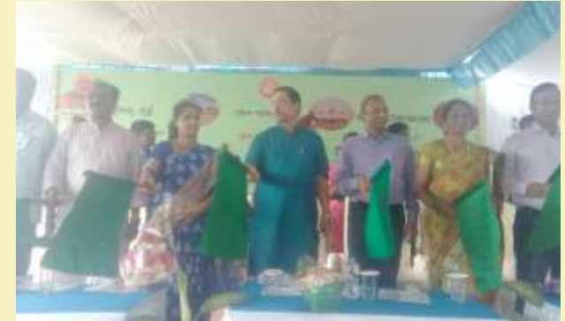
Flagging of Hubli-Varanasi new train

As soon as Modi govt came to power I established continuous contacts with the labour minister Shri Bandaru Dattatreya and other Sr officers in past three years the whole grant was released, with the result the hospital building is not only ready now but it was inaugurated by Sri Bandaru Dattatreya himself, and thrown open to public. The minister during the inauguration function announced another 50 bedded hospital on my request in the same Campus.