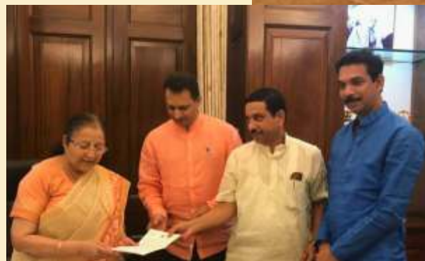
with the speaker in a delegation of MPs

carrying the work as such. I have been reappointed as a chairman of the committee from 1-9-2015 and 1-9-2016. Till date I have conducted periodical meetings and submitted the parliamentary reports on various matters of importance. I have also participated in the study tour to places of production and distribution of petroleum and natural gas. Of total of 24 standing committees relating to various departments, standing committee on petroleum is the most important. This is a committee comprising of 31 members from Lok Sabha and Rajya Sabha, to which the tasks such as considering the on grants relating to this department, considering and reporting annual reports submitted to me, studying the records of the national policy relating to the department and making report to Parliament are entrusted.