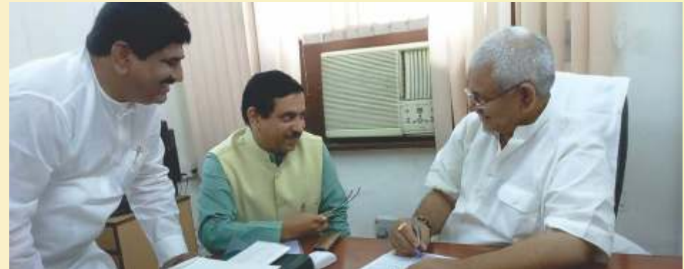
With Shri Manoj Sinha MOS for Railways Discussing about the Rly. Development of Constituency