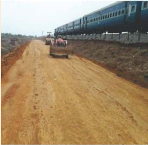
Hubli- Chikkajajur doubling works in swift progress

Proper utilization of natural resources stress on utilization of solar energy