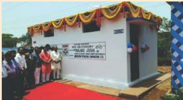
Inaguration of Toilet built from the CSR funds of HPCL.

57 Hi tech toilets in Govt schools are being constructed 28 in Dharwad taluk. In 2nd stage 26 toilets in Shiggaon and Savanur at total cost of Rs 3.13 Cr each costing Rs 5.5 lakhs per toilet this work is made possible by the funds under CSR of HPCL and entire works are completed.