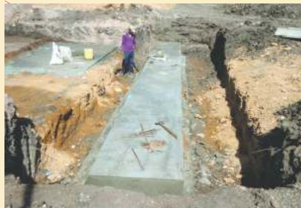
Conversion of Hubballi Hospet National Highway in 4 Lane work in progress

GIVE IT UP was a call given by the Prime Minister Shri Modi. As soon as he took over as a Prime Minister