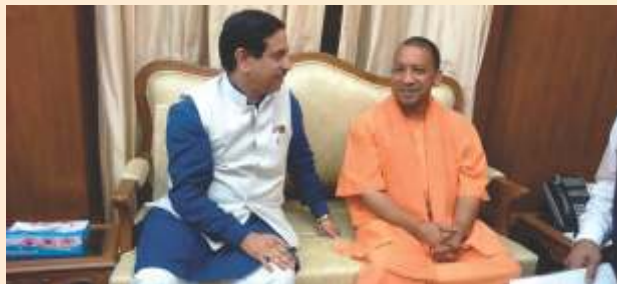
with popular BJP leader and Chief Minister of Uttar Pradesh Sri Aditya Nath Yogi ji

Under CSR of Gas Authority of India has provided the facility of digital classroom in 28 Govt schools. In response to my appeal GAIL this year has already given approval for providing digital classrooms in 50 more schools. Already in 20 Govt PU science colleges digital classes are provided and the work for providing digital classrooms facility is in progress in the remaining 30 schools Rs 1.6 Cr has been sanctioned for this purpose by GAIL.