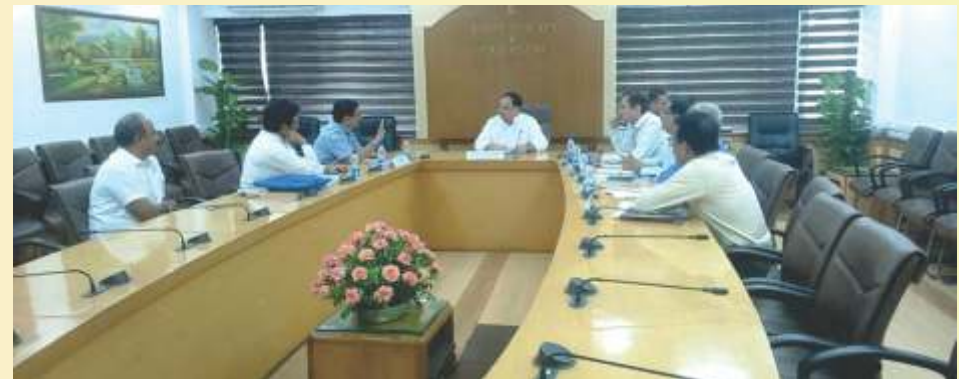
In a meeting with union health minister Shri J. P. Nadda about early completion of 200 Bedded Super Speciality Hospital in KIMS Hubli