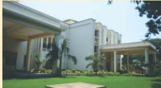
ESI hospital new building.

Since I was elected as MP for the first time in 2004, I have been proposing for the establishment of IIT in Dharwad but the then UPA Govt during its 10 year rule turned its deaf ears to this request of North Karnataka. It was a dream come true for the crores of people of North Karnataka when Shri Modi Govt announced the establishment of IIT in Dharwad a beautiful building for IIT is coming up in 600 acres of land in a beautiful surrounding of Dharwad.