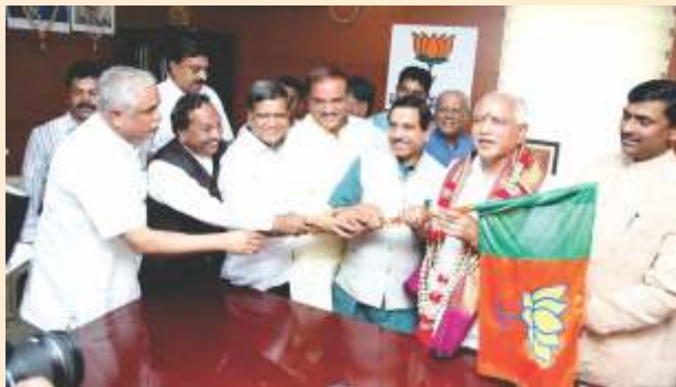
with senior party leaders in organization of party