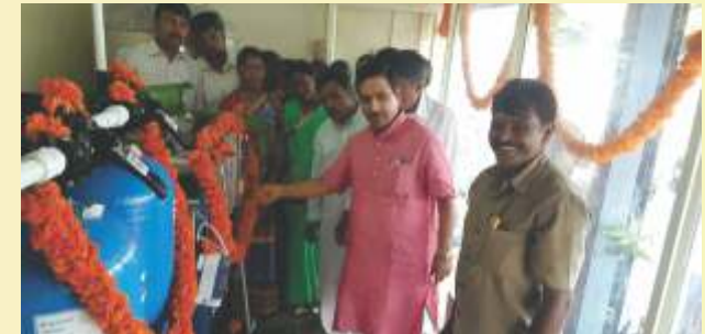
Opening of a pure drinking water unit in a village of the constituency.

A project report for the construction of a beautiful park in the land belonging to HDMC in ward NO- 30 Hubballi has been prepared approval obtained at Rs 31 Lakhs ONGC has provided Rs 20 lakhs under CSR and remaining 11 lakhs to be provided by HDMC. The tender process is over and work is in progress.