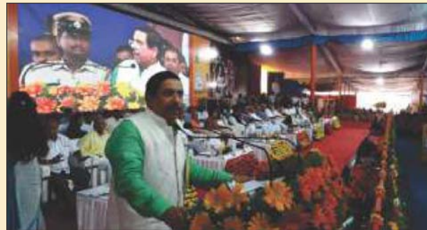
In launch of PM Ujjwala Yojana for Karnataka in Hubli

It is planed to bring 5 Cr ore women under the bracket of this plan. By this Scheme already 2 Cr. poor women are covered and liberated from smoked kitchens.