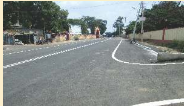
(Improved navalgund ibrahimpur road, road under CR F)