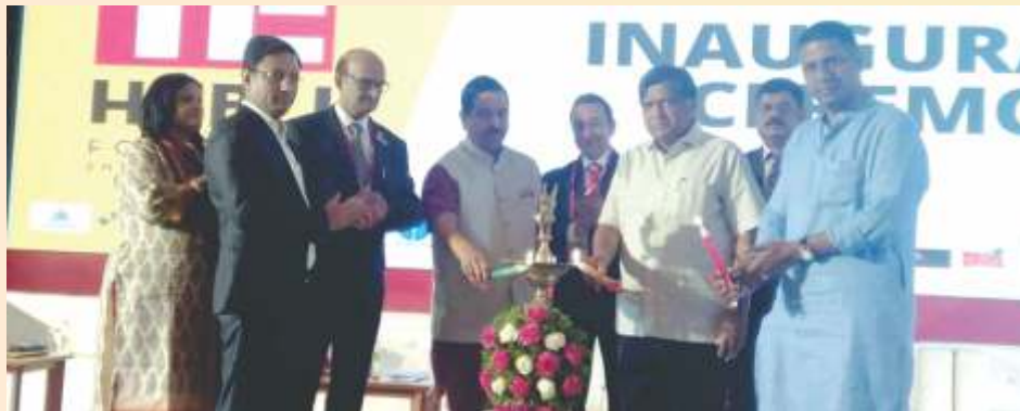
In inauguration function of TiE in Hubli