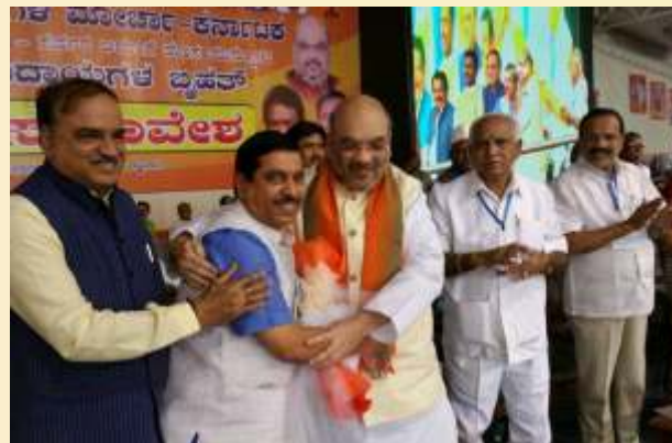
With the party president Shri Amit Shah