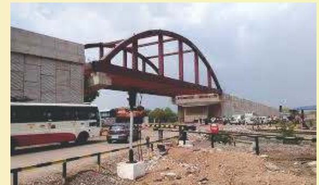
Over bridge Rly gate No-1 on Hubli Gadag Rd.

Near Dharwad Rly station on road connecting Kalyan nagar to Navanagar a Railway over bridge NO-297 is already sanctioned and the plan map ready, work will start soon.