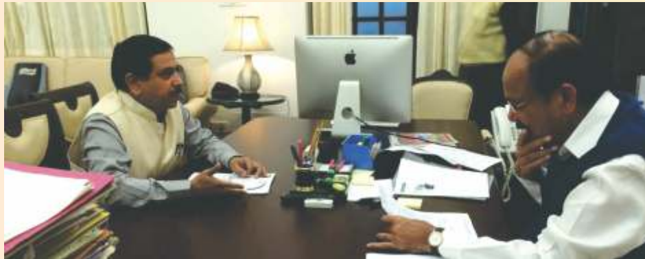
Meeting union Information Minister Shri Venkaiah Naidu pressing for establishing DD Centre at Dharwad