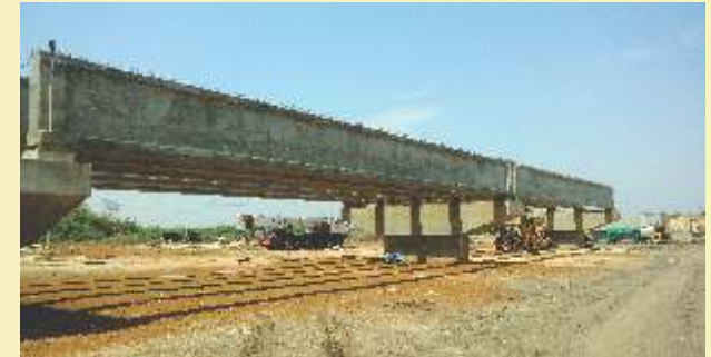
Bridge built across Benni Halla on National highway -218, near Yamanur

Pak occupied Kashmir had become the hiding place of terrorists and launching surgical attack India destroyed terrorists hide outs, is evidence of modiji's courageous leadership.