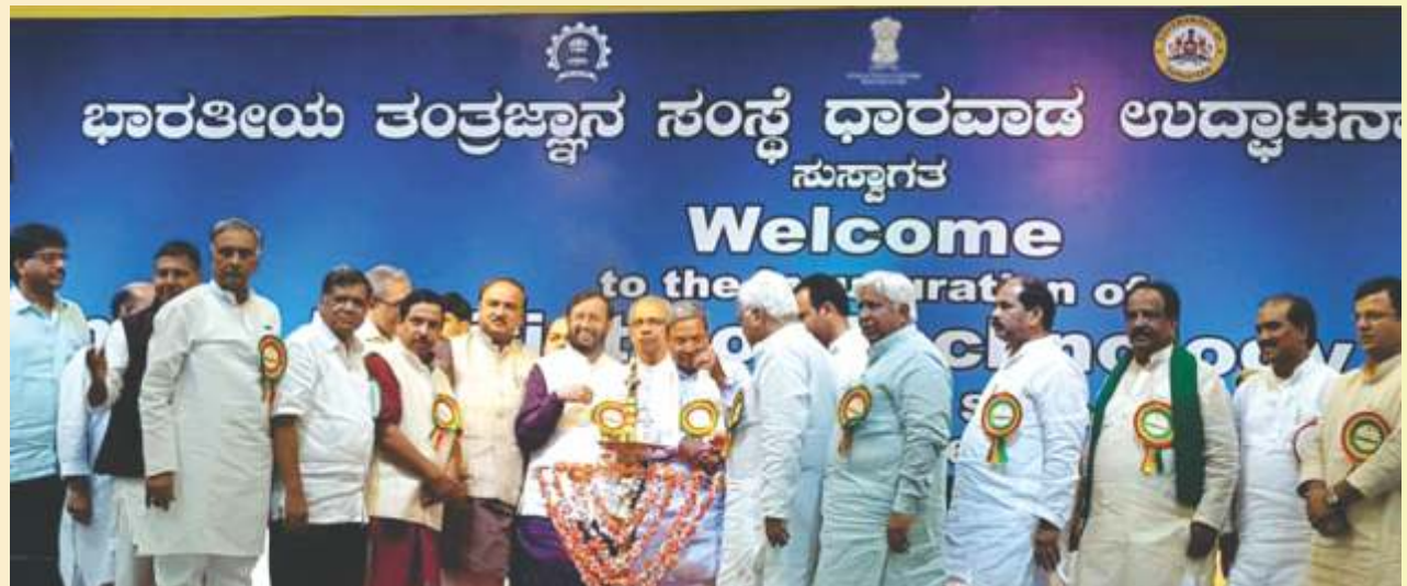
Inauguration of IIT Dharwad

Under Amrut Yojna a sum of Rs 160 Cr have been sanctioned by the Union Govt to twin cities for taking up the projects of under drainage & drainage water purification unit and development of gardens in twin cities. This is another gift of Modi govt. In this 50% of the share of the central Govt ie Rs 80 Cr has already been released to the state Govt. In total of Rs 160 Cr, state Govt's share of 20%, and ULB's share of 30% are included works for all these projects are in progress.