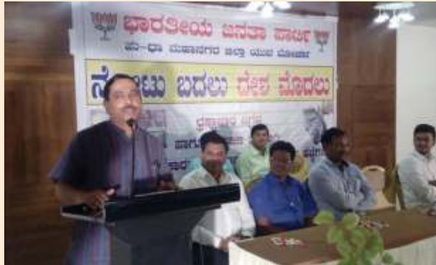
In a symposium on demonetization