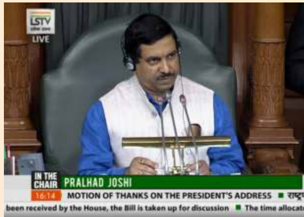
In the seat of Lok Sabha speaker

As a member of various parliamentary standing committees like business advisory committee, law and Justice, ethics, very prestigious panel of speaker, I am contributing my services to best of my ability.