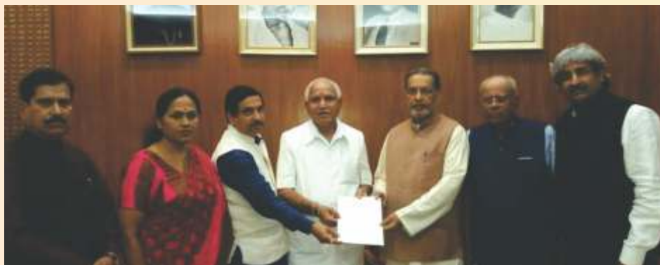
In a delegation of State MP's to union Agri. Minister Shri Radhamohan Singh