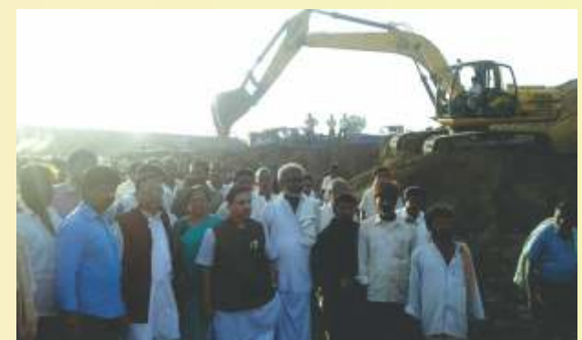
Supervising a massive excavation work at Tuprihalla Near Kabbenur Village