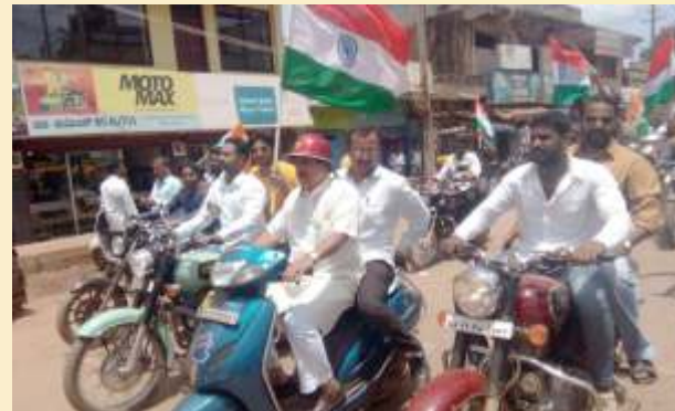
in a program held in Dharwad constituency relating to Tiranga Yatra which was held in August 2016 through out the nation