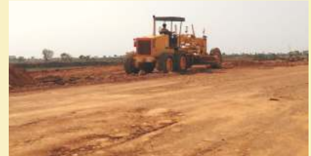
(work in progress on Hubli bypass road)

Freedom from the exploitation of middlemen: All the