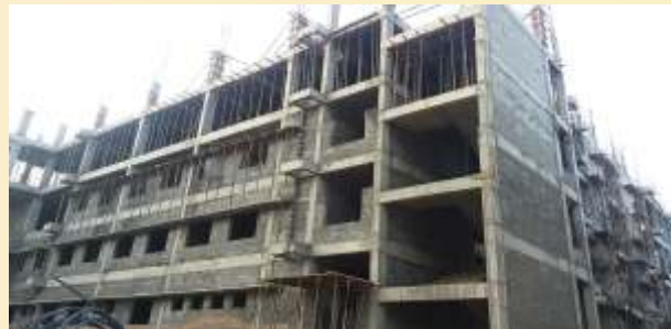
New 200 bedded super specialty hospital atKIMS Hubli in PMSSY under construction

Mangalore Refinery and Petrochemicals Limited MRPL under its CSR program has given approval for the construction of a multistoried building to house an Anganwadi, a library and an Auditorium etc. at a cost of Rs 45 lakhs at Kabbennur village work order has already been issued. Soon work will start after Bhoomi Pooja. A proposal is also submitted to this company for the supply of 2000 desks to various schools in constituency and the company has agreed to provide them during the next financial year.