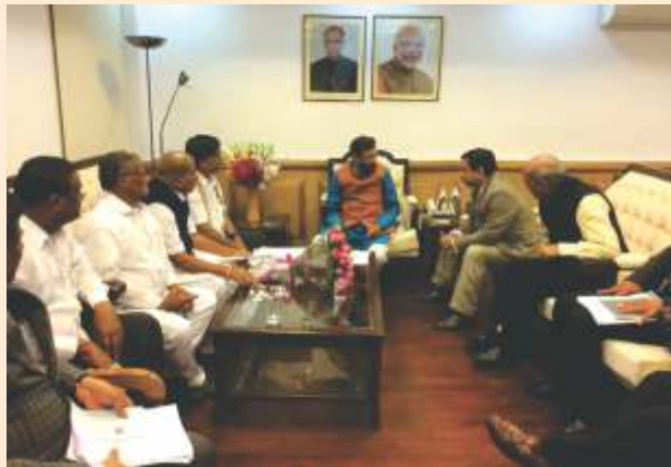
(in a delegation of MPS & ministers of Karnataka to HRD minister)

The construction of International Airport in Hubli is fully complete and ready for inauguration when operational this airport will be fit for the flights of Airbus 321. New Runway is complete building of the main terminal is almost complete. The cost of the entire work is Rs 160 Cr. The state Govt has given 600 acres of land at free of cost. In the past the construction of Airport was going at a snails pace. In the three years after the NDA Govt came to power the speed of the construction of airport had gained momentum.