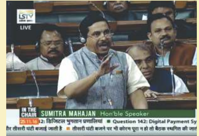
participation in a debate in Parliament on an important subject