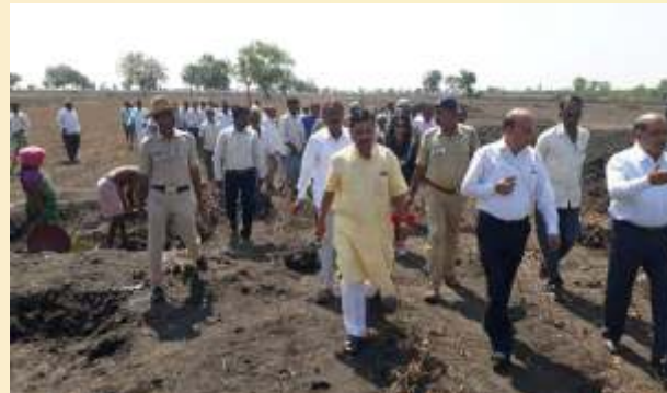
In a visit to draught affected areas of the constituency

I have been successful in getting enhanced grants from ONGC and 10 RO's have been installed in various villages and 1 in Hubli Old bus stand, at total cost of Rs 1 Cr.