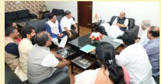
with Shri Rajnath Singh Union Minister in a delegation of MLA's and senior leaders of the state