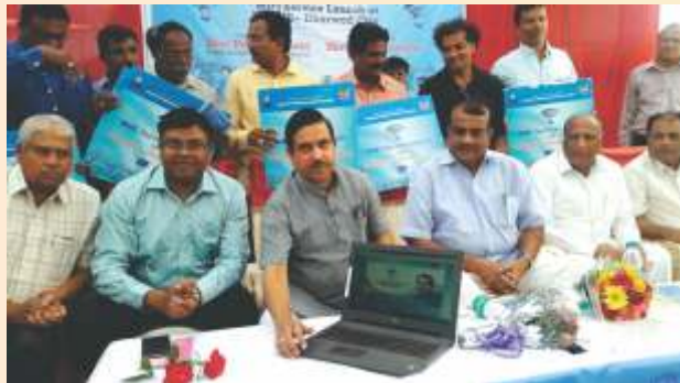
Free WiFi facility in Hubli Vidyanagar inauguration

Before the digital India plan was started in a period ie from 2011-14 only 358 km of Optical Fiber line was laid where as in a short period of 2 years of NDA rule led by Shri Modi 112,884 km long Optical Fiber has been laid. As a result of this 50,465 gram panchayats are provided with the broadband connections and access to Internet was provided, which is certainly a communication revolution!