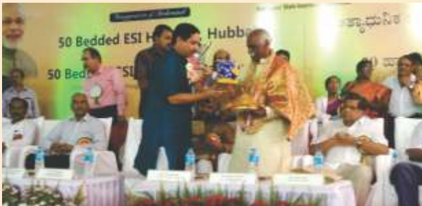
Union minister for labor Sri Bandaru Dattatreya in the inauguration ceremony of ESI hospital in Hubli.